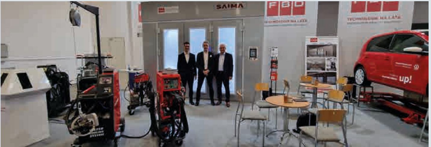
In the Saima Sicurezza booth at the fair