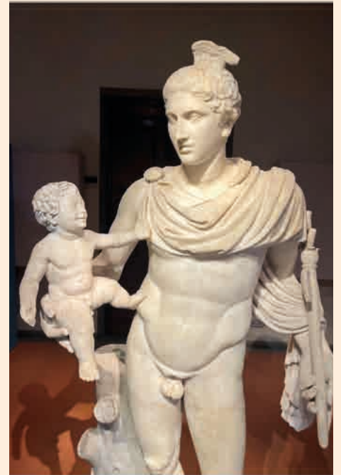
Mercury with Child Bacchus, 2nd century AD