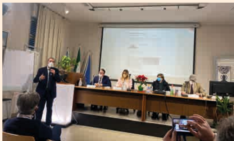
Presentation of our sanitation systems for school classrooms at the ITIS Galileo Galilei in Arezzo.