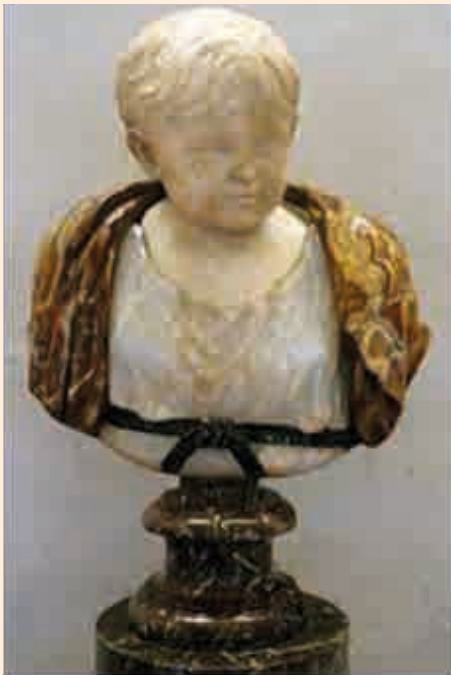
Sculpture of the head of Prince, (child Nero)

From the Uffizi newspaper a series of works dedicated to children in the time of ancient Rome. Children in that civilization had a role that influenced the cultural and economic social dynamics of the time. A rediscovery of the importance of children and the centrality of the child world in Roman civilization and in ancient civilizations, as also demonstrated by the growing interest in this subject by scholars. The works photographed here are particularly interesting.