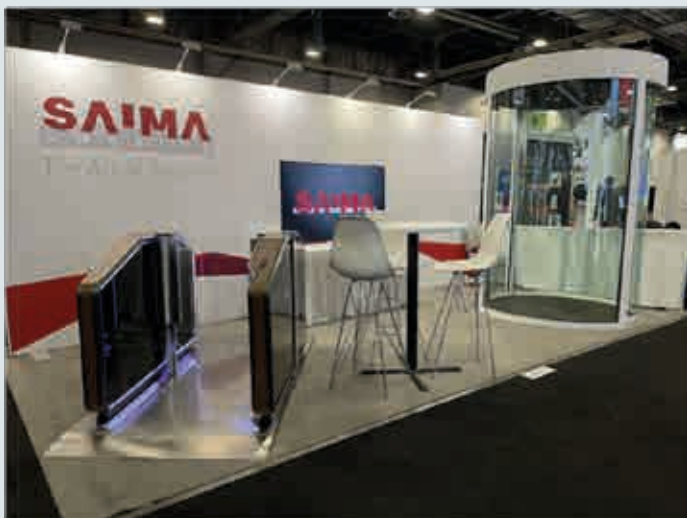
In the photo the booth of Saima Sicurezza at ISC West Las Vegas