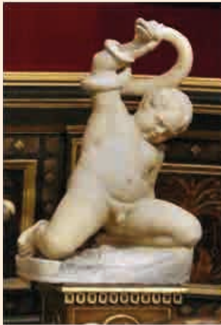
Child Hercules who strangles snakes in a sculpture of the second half of the first century AD