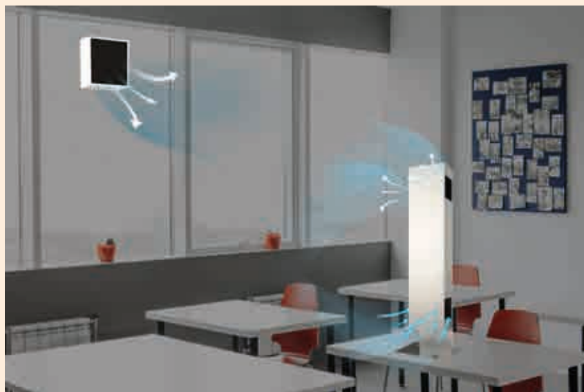
An example of our sanitation systems

The sanitization of air today, as the sanitization of water in the 19th century, represents the new frontier to be studied for the health of the environments. It is CO2 that favours the infection of the virus in closed spaces, as well as the drowsiness of the pupils in the classroom. So the classrooms can be a safe place from infection, thanks to the new systems, which sanify and favour the replacement of the air, without annoying noises. There are no sensors to measure the viral load in the air, but you can improve its quality by systematically monitoring the CO2 level. Only in this way our children and grandchildren will be able to go to school safely in all seasons.