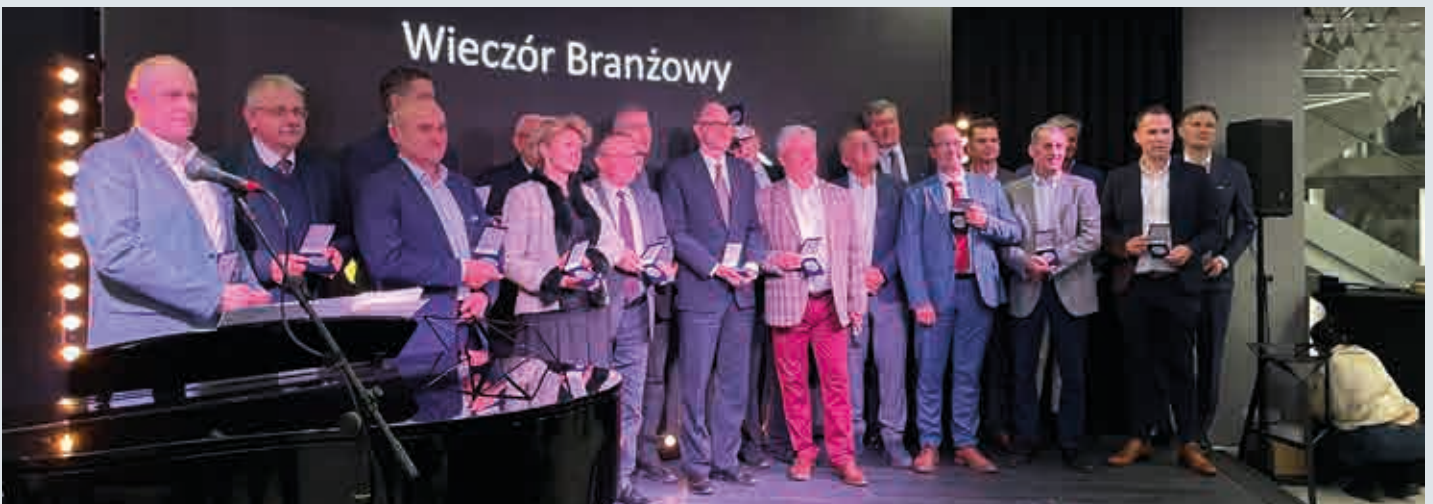
Awards in Poznan, Poland