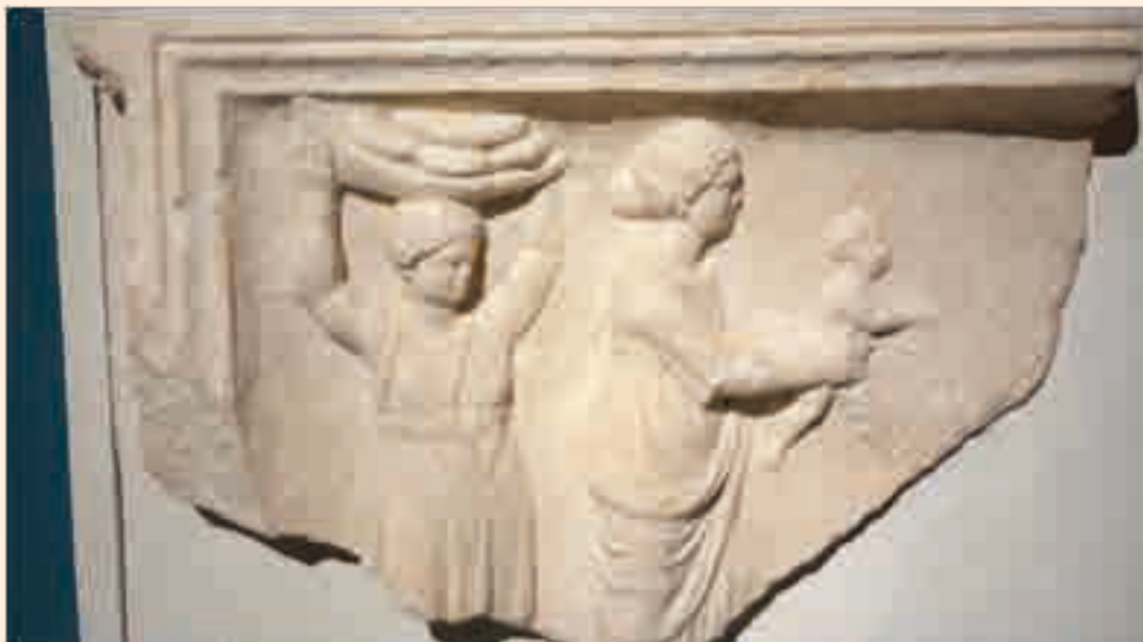
A relief dedicated to the Nutrix Augusta, (second half of the 2nd century AD)