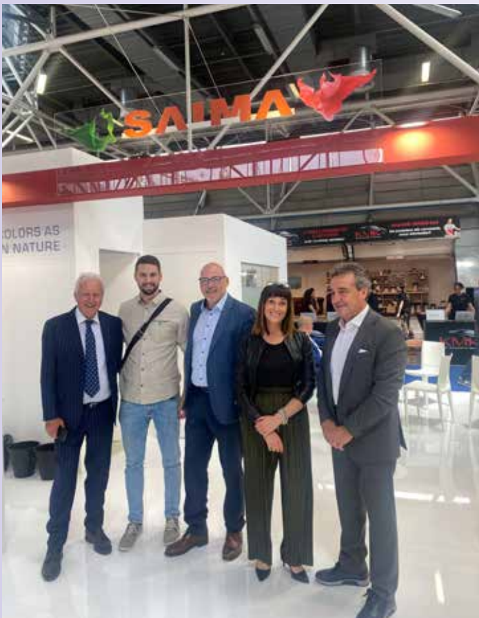
Our distributors from Austria were also present