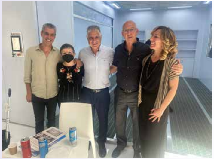
From Israel with a long-standing historical friendship