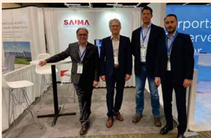
The Saima Sicurezza team present at AAAE in Seattle

One of the most interesting events on American soil worth mentioning is that of Seattle , that is the AAAE Convention reserved for the airport world where we were also in attendance, with our Exit Lane Corridor and with Vasari , the boarding gate solution of SAIMA by Pininfarina which narrates a totally new concept to create access control systems. The Vasari gate was in fact designed to combine fundamental concepts in terms of access control, which often seem to be in antithesis, such as: protection, control and beauty. Now, thanks to Saima, it is possible to experience the feasibility of this union. Our absolutely innovative technical solutions have in fact implemented the performance of our product and therefore Vasari not only protects the place of installation but also fluidly regulates the flow of visitors and, finally, with its appearance, transforms into an actual design object capable of very clearly characterising and defining the place of installation, also guaranteeing a pleasant user experience for anyone who uses it.