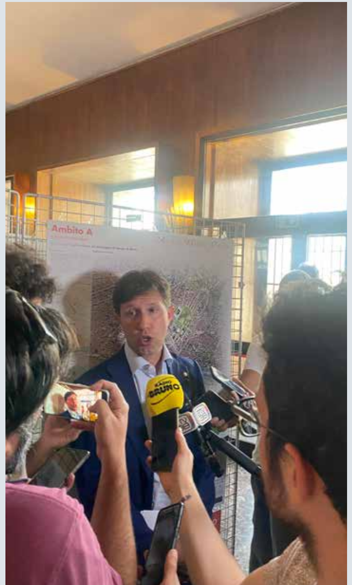
The mayor of Florence, Dario Nardella answering the questions of the journalists present