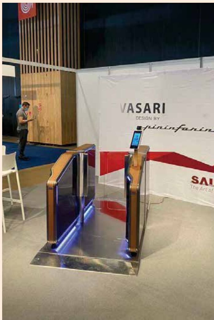
At Passenger Terminal 2022 our Vasari gate received the applause of all visitors