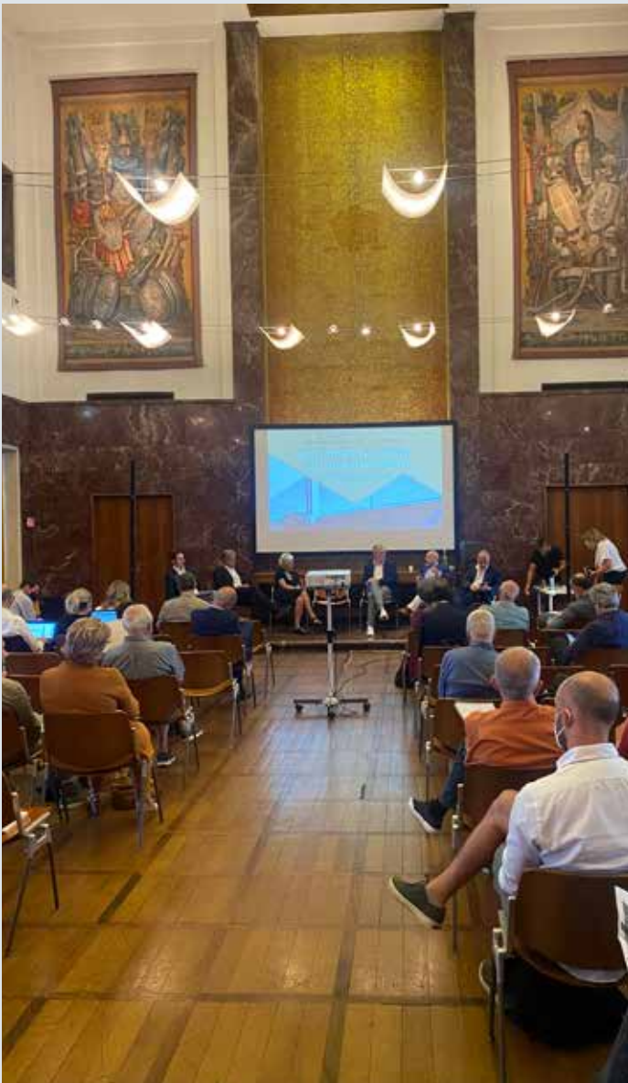
Meetings taking place