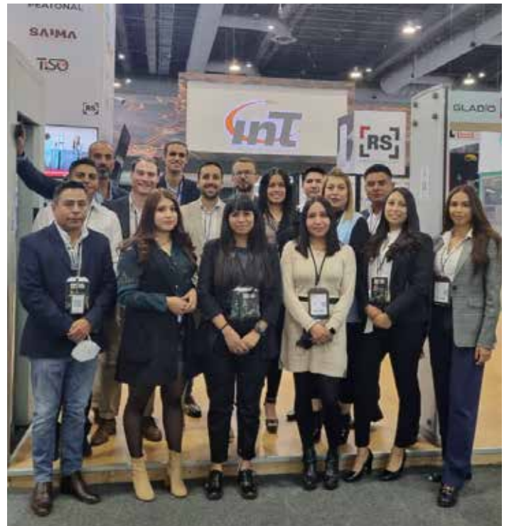
Travelling SAIMA DAYS in Mexico City visiting the most important Exhibition as for Latin America. Different SAIMA products shown on such an occasion: some model of swing gate , some full height turnstile and one of our typical security booths. SAIMA " special device " for the protection of any ATM booths had a great success too.