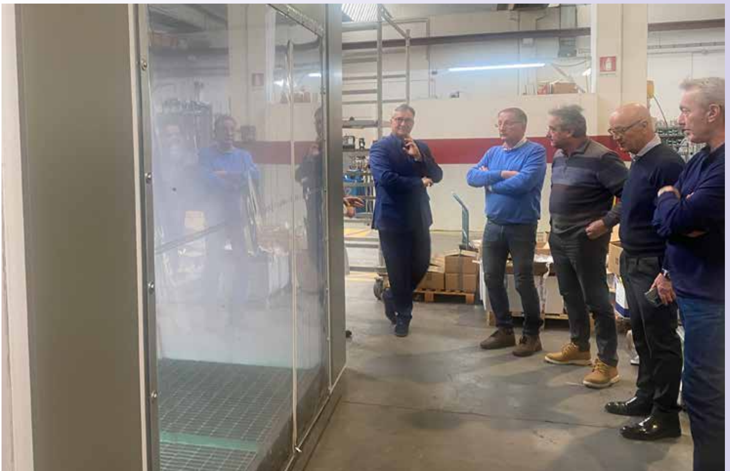
SRS functionalities are explained to the staff of Saima Meccanica