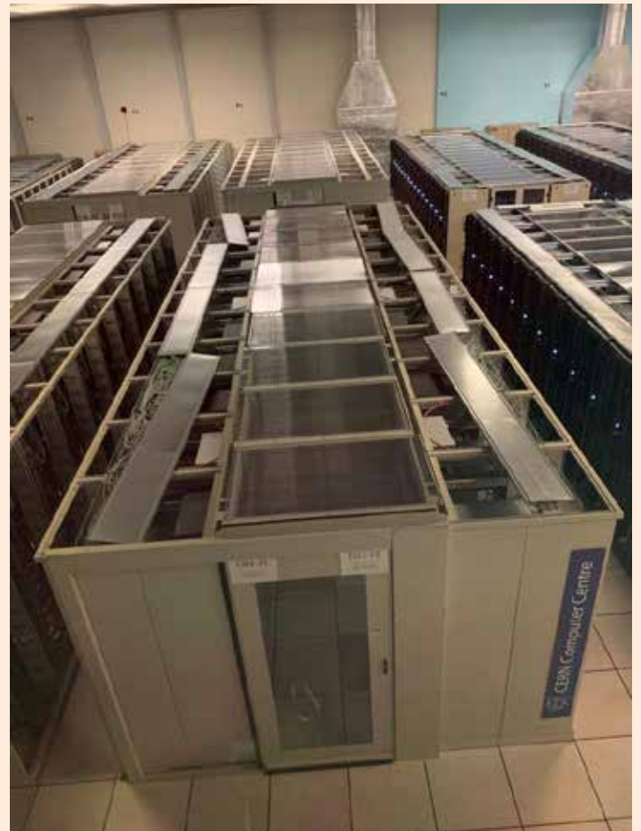
Detail of the Computer Centre