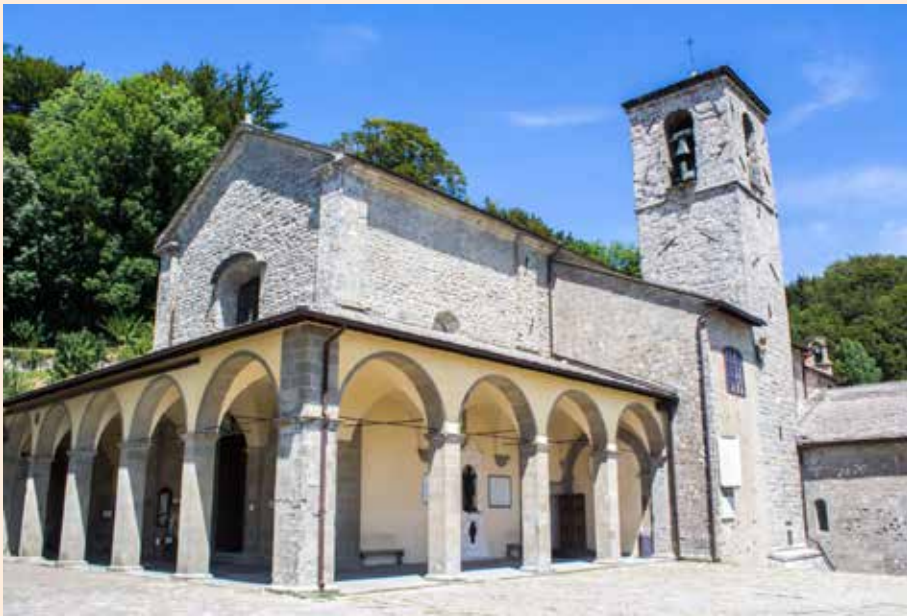
The Basilica of La Verna.

Anyone who does not know La Verna and the famous Sanctuary has missed the opportunity to visit one of the most beautiful and magical places in the Casentino Forests. Centuries-old beech forests immersed in the Franciscan setting par excellence welcome and invite us to visit the most secret sites of the sanctuary where St. Francis lived and died. The walking tour includes seven to ten kilometres for a journey of true spirituality amidst the temple of nature that has remained unspoiled. 14 September 1224 marks the history of La Verna, since then a destination for thousands of visitors from all over the world. Art, faith, culture and history of the life of St. Francis will remain unchanged over time, with the historical and monumental testimonies of the church of S. Maria degli Angeli (1250-1260) and of the Basilica of S. Maria Assunta (1348). It is important to visit the Chapel of Relics, where the remains of