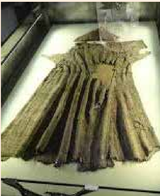
The relic of St. Francis kept in the Chapel of Relics.

St. Francis are kept. On the floor there is a plaque that marks the point where the "miracle of the stigmata" received from the Saint took place. But the true mystery that defies the force of gravity and the normal rules of gravitational balance lies in standing before the " Sasso Spicco " where the "poor man of Assisi" used to kneel in prayer in front of the granite mountain. Even today, that protrusion of suspended stone continues to defy gravity. And there is no architect who knows how to find a rational answer to this extraordinary miracle of nature. Go and see it!