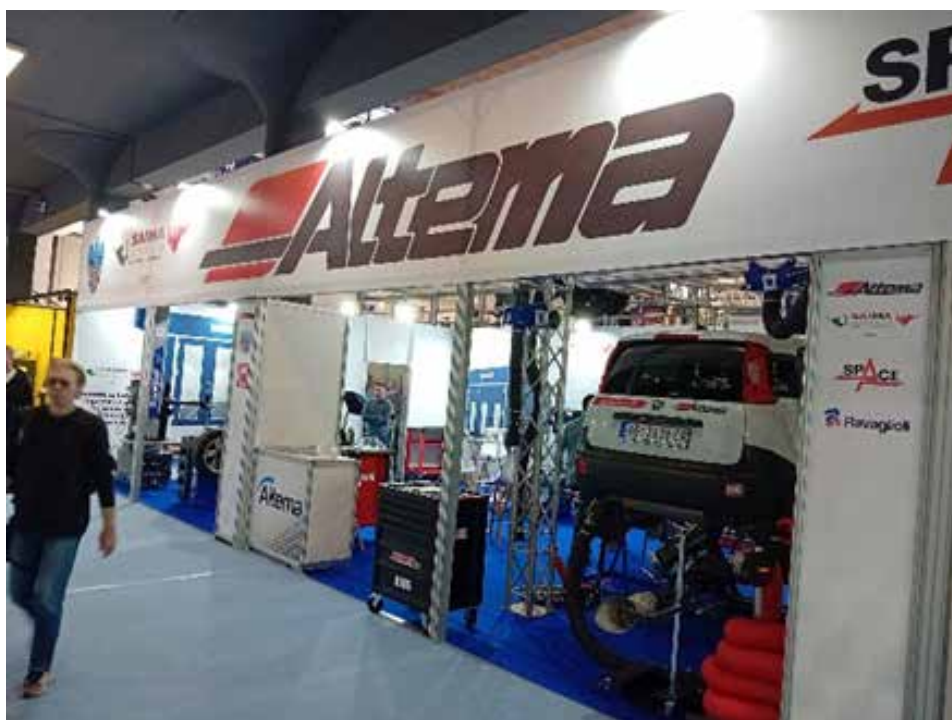
Our stand at the trade fair.